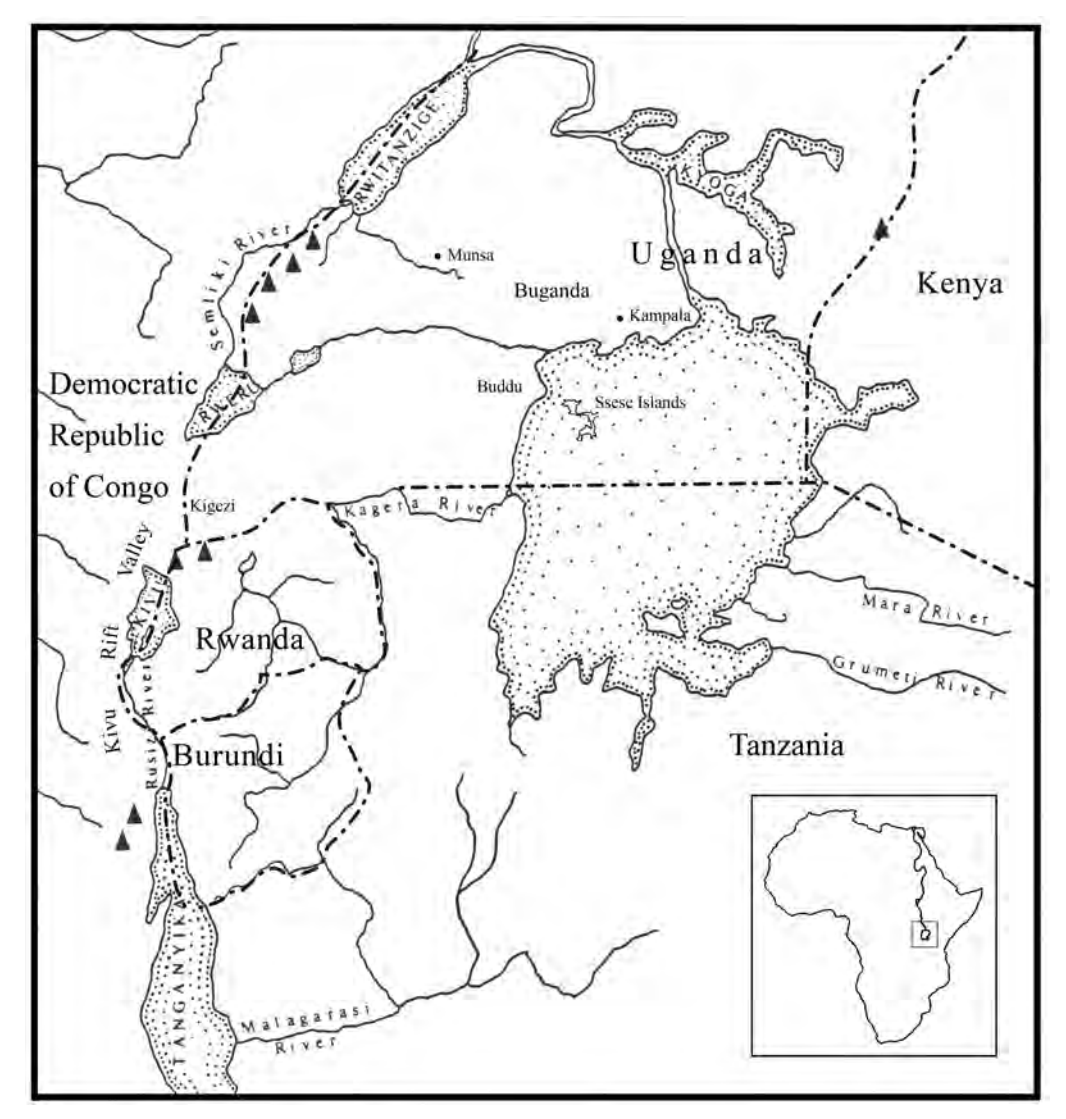
MAP 1. The Great Lakes Region of East Africa. Map made by Tom O'Connell, Digital Media Services, Northwestern University.

that they helped shape the transformative experiences of capitalism in Africa.<sup>28</sup> They also lie beyond the explanatory power of "a generic colonialism" that has been "given the decisive role in shaping a postcolonial moment."<sup>29</sup> Regional histories of healing practice broaden explanations of this public business of seeking burning elders by