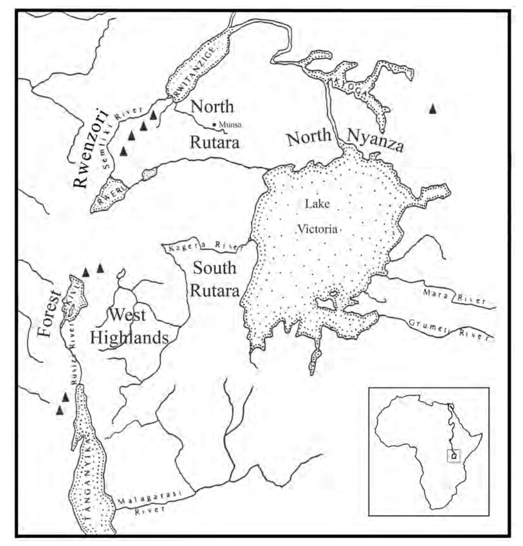
MAP 2. The location of some ancestral speech communities, ca. 1000 to 1500 C.E. See Figure 1 for a partial listing of the languages spoken today in the Great Lakes region that descended from these communities.

roundings, these assemblies began to think of the spirits' corporeal forms—water-courses, hills, caves, and prominent rock outcroppings—as sources and categories of their power—fertility, fecundity, war-making, controlling rain, hunting, and so on. <sup>112</sup> Instead of ensuring prosperity and fertility in a particular territory, the new territorial leaders might have argued that their new spirits could ensure prosperity in entire categories of the environment and of life. <sup>113</sup>